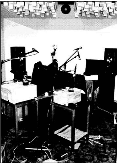
HOQUETS in the midst of recording