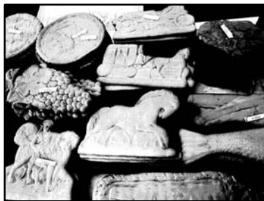
So many couques to choose from

If you know the song and love it, wait till you know what it was written about: it's a real treat !