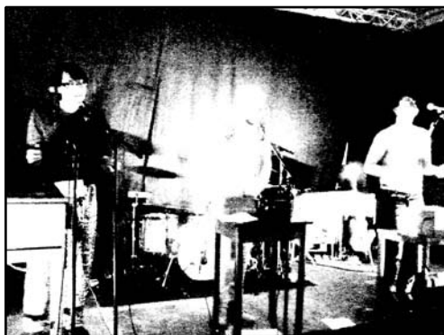
HOQUETS at Musée Belvue 6 March 2010,