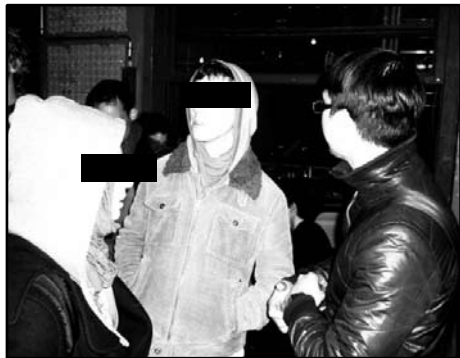
Fan club Presidential initiation.

We know full and well who they are, but here we have obscured their faces. They may not always be well informed, but they are here to guide you in the way of being a fan of HOQUETS. We can't write their names here either, but they would be glad to respond to any email you send to fanclub@hoquets.net